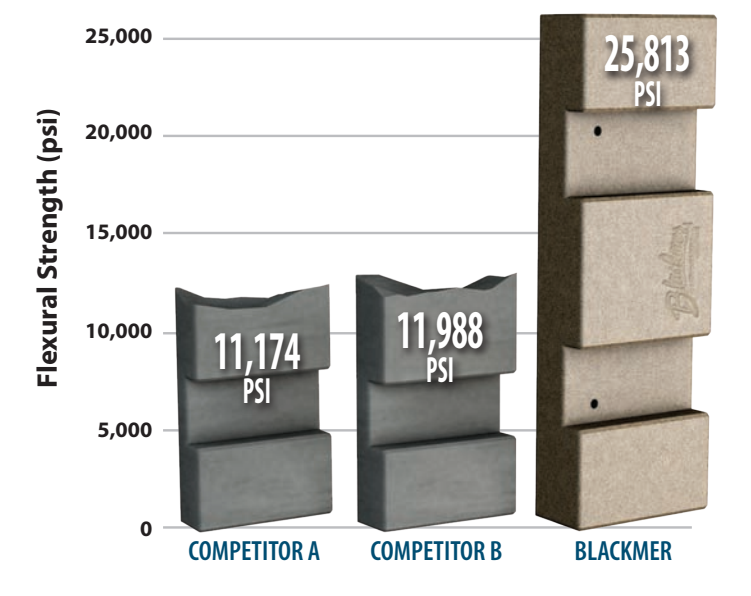
Pressure is great for forming diamonds, but it can wreak havoc on pump components. Side-by-side comparisons have confirmed that Blackmer sliding vanes outperform competitive models by more than two-to-one in flexural-strength tests.

• Flexural Strength: Side-by-side comparisons revealed that the vanes in a TX pump outperformed competitive models by more than a two-to-one ratio when measuring flexural strength. The TX vanes can withstand pressures up to 25,813 psi (1,780 bar), while Competitor A's flexural strength topped out at 11,174 psi (770 bar) and Competitor B's was only slightly better at 11,988 psi (827 bar).