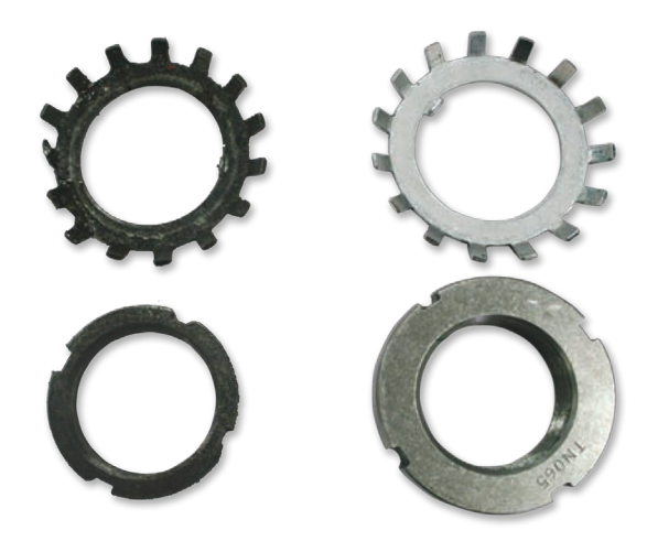
A tight fit prevents slippage and keeps everything running in perfect alignment. Blackmer's lock nuts are carefully machined for a perfect fit every time.

knockoff models did not open properly, which allowed the internal pressure of the pump to reach more than 200 psi (13.8 bar). When internal pump pressures are allowed to get this high, the system can be destroyed with catastrophic (and dangerous) failures of hoses, meters and nozzles.