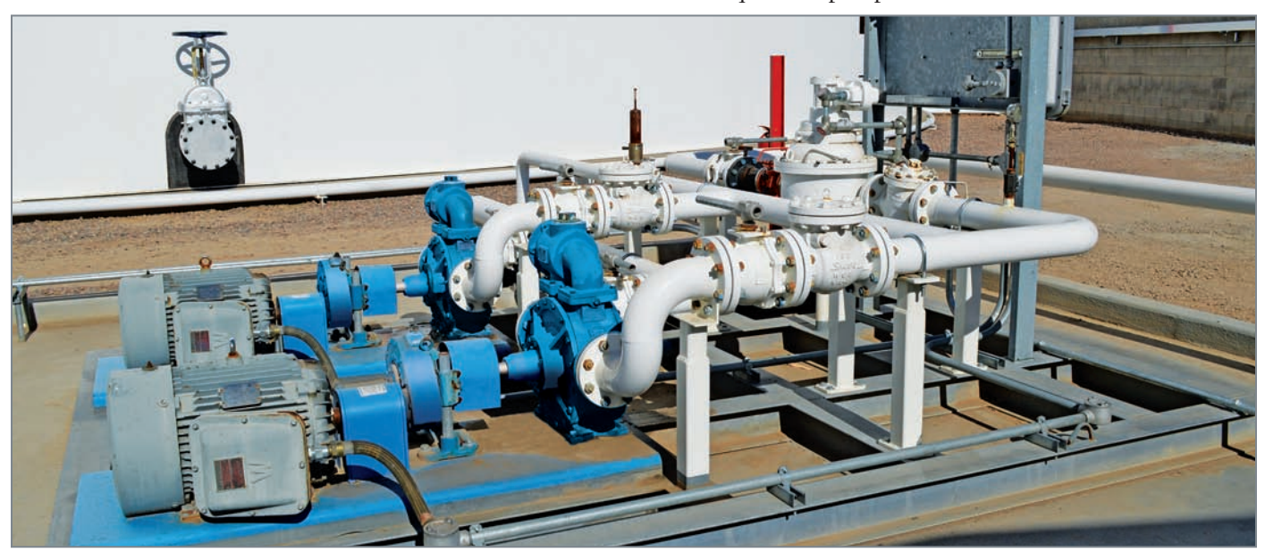
Among the many benefits that sliding vane pumps can offer to storage terminals are their ability to handle very-thin liquids along with those that have viscosities to 50,000 cSt.