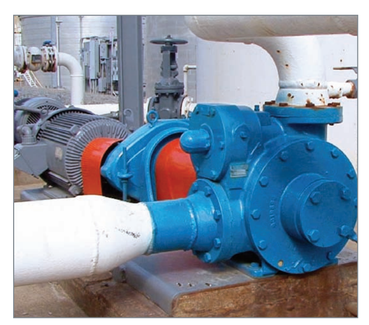
The cost-effective operation of sliding vane pumps can help storage-terminal operators lower energy use at their facilities, which leads to lower overall operating expense.

the many different flow rates, pressures and viscosities that are found in their facilities.