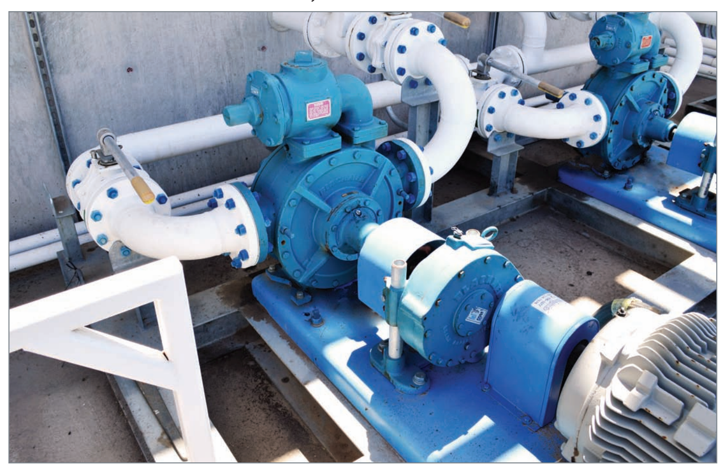
Many liquid-terminal operators are striving to optimize the performance of their facilities in the areas of delivery and storage efficiency, energy consumption and overall cost-effectiveness. A growing number of these operators are discovering that they can achieve their goals through the use of sliding vane pumps.