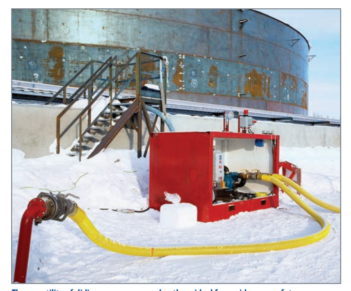
The versatility of sliding vane pumps makes them ideal for a wide range of storageterminal applications, including the transfer, blending, mixing and packaging of a varying array of liquids.