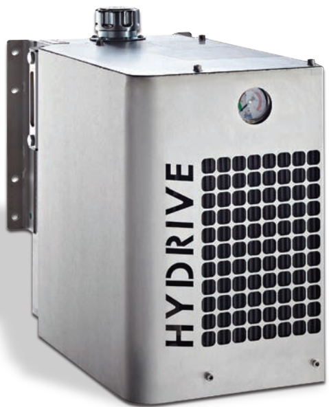
HYDRIVE Series: 2010 A Hydraulic Cooler