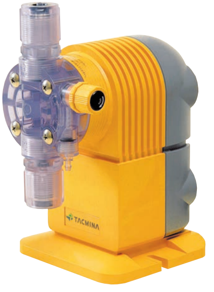
Electronic Diaphragm Pump

driven pumps that normally operate at speeds less than 100 to 150 spm since slowing the motor causes each stroke to take longer to complete from start to finish. However, electronic metering pumps, which are pulsed by a solenoid, can operate at less than one spm because the timing of each stroke from start to finish is uniform at every stroking speed. The moving parts in modern diaphragm