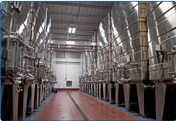
Rodney Strong's new 10,500-square-foot state-of-the-art cellar in Healdsburg, CA, USA utilizes 51 stainless steel 6,000-gallon fermentation tanks to accommodate premium grapes from their Cooley Ranch Vineyard.

Rodney Strong tested the new cellar during the 2015 season, which included utilizing the Wilden PS8 Saniflo FDA pumps for pumping over and was extremely pleased with their performance. Villanueva commented, "The performance, the high quality parts, the expert assembly compared to the competition made me very comfortable in the decision to go with Wilden pumps, and we are very pleased with the results." In fact, they are so pleased with the initial order of 16 pumps, Rodney Strong has ordered an additional 43 pumps to complete the cellar.